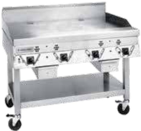
Model CG-48R (shown w/optional stand & casters)